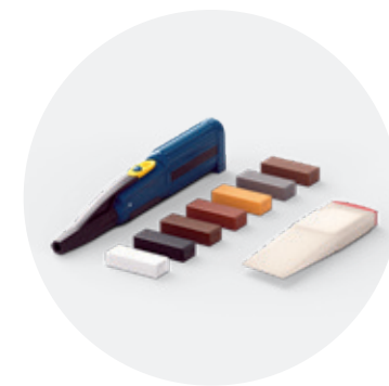
Repair kit QSREPAIR