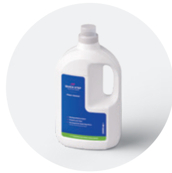
Floor cleaner 1 L or 2 L QSCLEANECO1000 QSCLEANECO2000