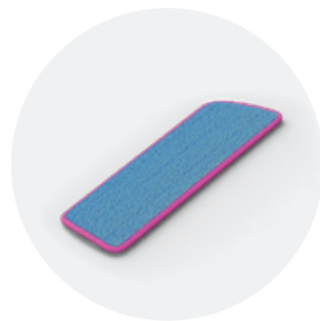
Cleaning mop QSSPRAYMOP